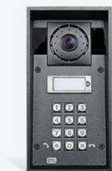
2N® IP Force