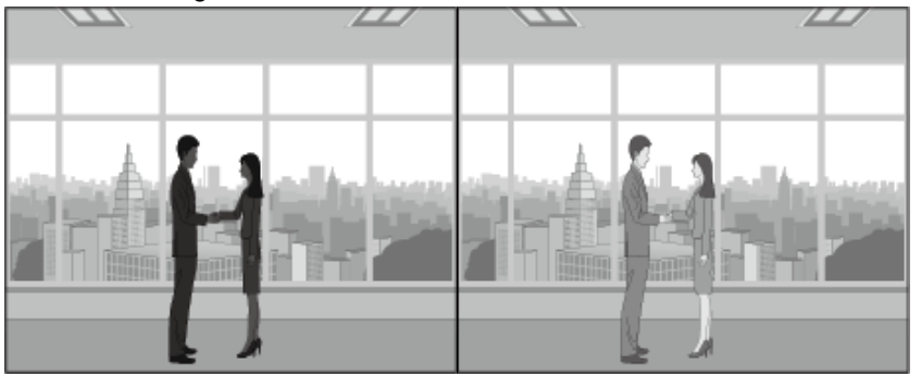
WDR mode off

The WDR (Wide Dynamic Range) mode shows both a dark area and a bright area clearly in a backlight environment. This method captures once with a fast shutter to show a bright area clearly and again with a slow shutter to show a dark area clearly, using the dual shutters of the camera, and then combines only the parts shown clearly from the two images into one image. If the WDR mode is used, noise may occur between the bright area and the dark area.