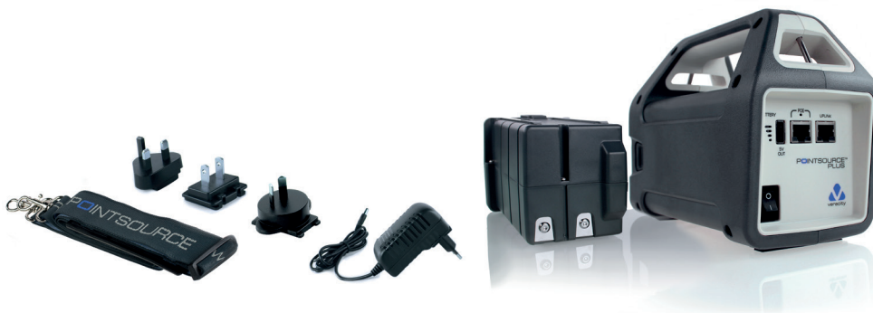
IP CAMERA INSTALLATION TOOL COMPARISON TABLE

POINTSOURCE Plus has a battery life of 3 to 5 years, or 200 - 1000 cycles depending upon discharge depth and operating temperature. The battery status indicator shows the remaining charge in steps of 25%. The simple design of the system allows the removable battery to be recharged whilst POINTSOURCE Plus continues to be used with a second battery.