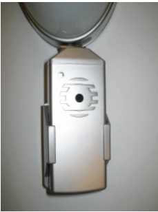
Fig.11 WalkTester in holder and fitted to D-TECT, ready for walk testing

Slightly loosen the stainless steel screw on the bottom of the D-TECT, just enough so that the drilled tab on the WalkTester bracket can slide around the screw thread. Then gently tighten the screw to hold the WalkTester and holder in place (Fig.11). Note the WalkTester can be orientated around the base of the D-TECT detector within 180 degree so as to allow for visibility during walk testing. Turn the WalkTester on.