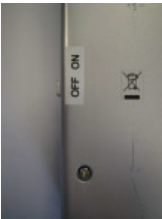
Fig.6.6 On / Off switch