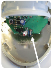
Fig.1 D-TECT IR emitter

*Please note that some of the earlier versions of D-TECT's were not fitted with IR transmitters and so the WalkTester will not work with these units. To verify please take the cover off the D-TECT and look at the **bottom of the circuit board for a blue IR LED (Fig.1). If this is present then the WalkTester will be able to communicate with the D-TECT.