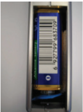
Fig.7. PP3 battery fitted