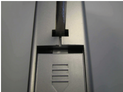
Fig.4. Removing battery compartment cover

First fit a PP3 battery into the WalkTester battery compartment (Fig.5 & Fig.7). This is done by removing the battery compartment cover as shown in Fig.4. Please ensure that the on/off switch on the WalkTester is set to the 'off' position while connecting the battery (Fig.6). When fitted close the battery compartment and the WalkTester is ready for use (Fig.8).