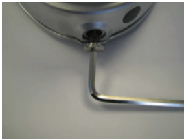
Fig.9. D-TECT cover and screw

Remove the cover from the D-TECT housing by loosening the stainless steel screw at the bottom of the D-TECT (Fig.9). This will allow access to the programming button shown in Fig.10 (and to also verify the presence of the Blue IR Emitting LED).