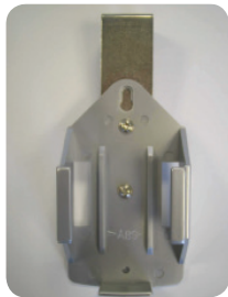
Fig.2 WalkTester holder & bracket

NOTE: For D-TECT 2 and D-TECT 50 the IR LED is on the front of the circuit board. On the D-TECT 3 it is on the rear PDB.