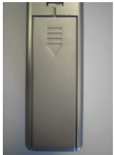
Fig.8. Cover replaced