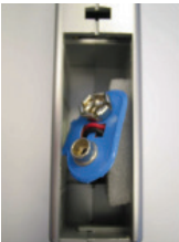
Fig.5. PP3 battery connector