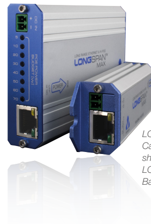
LONGSPAN Max Camera device is shown here with a LONGSPAN Max Base device.

LONGSPAN Max delivers unrestricted 100Base-TX with 802.3bt high power POE at distances far beyond the normal Ethernet limits for problem-free external PTZ IP camera installation