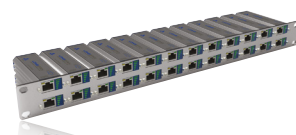
Up to 24 LONGSPAN units can be mounted in a 1U rack space. Ask for VLS-1U.

replaced with a LONGSPAN Lite. LONGSPAN Max Base and Camera extenders deliver full bandwidth Ethernet up to 820 metres. The Base unit can output the maximum POE permitted by the 802.3bt standard.